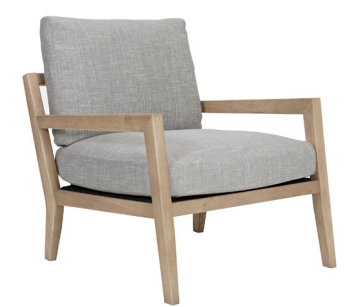
Reversible Leather sew-back cushions ing options (only in fabric)